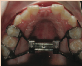
Four weeks later, expansion complete