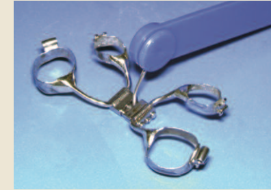
Your orthodontist will explain how to activate your child's appliance

Age alone is not the best predictor when a palatal expansion appliance should be used. Ideally a patient should still be growing. An orthodontist can estimate skeletal maturation and determine whether a patient is still growing by analyzing the growth plates on a hand-wrist x-ray. Patients who have completed growth may require surgically-assisted rapid palatal expansion.