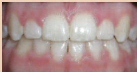
Braces close the spacing and align the bite creating a healthy, beautiful smile

Palatal expansion is a combination of tooth movement and jaw expansion. It works by widening the two halves of the upper jaw, called the palate. The two halves are joined together by a 'suture' in the middle of the roof of the mouth. The orthodontist custom makes an expander for each patient. An expander can be fixed or removable. The expander is attached to the upper back teeth and eases the suture apart, which makes the upper jaw wider. As the jaw expands, new bone fills in between the two halves of the palate. This process is called distraction osteogenesis. Expansion can take a few weeks to a few months, depending on the amount of expansion required for an individual patient.