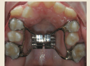
Examples of bonded and banded fixed expansion appliances