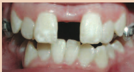
Front view, expansion complete